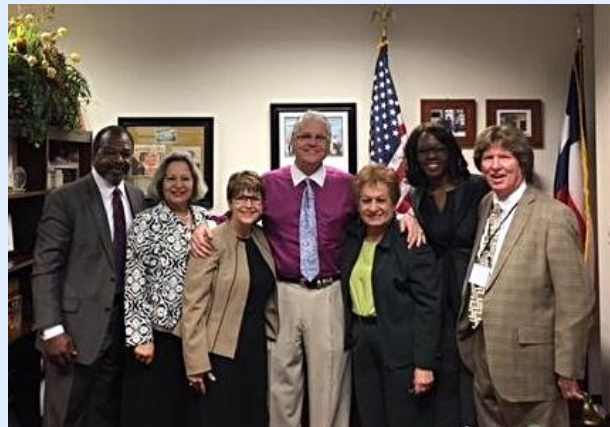
Meeting with Aldine ISD Leadership