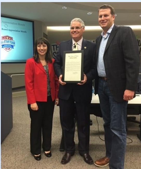
Presenting a resolution honoring the Humble ISD School Board in honor of School Board Appreciation Month

Visit the Humble ISD Legislative Committee page by clicking here