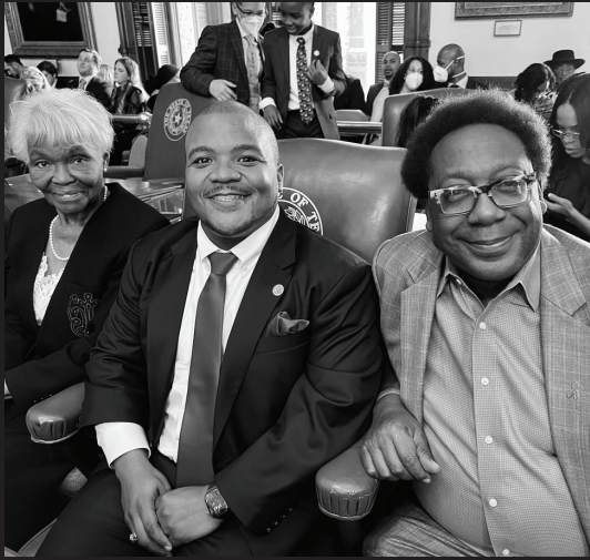
Representative Jones with family on the opening day of the 88th Legislative Session