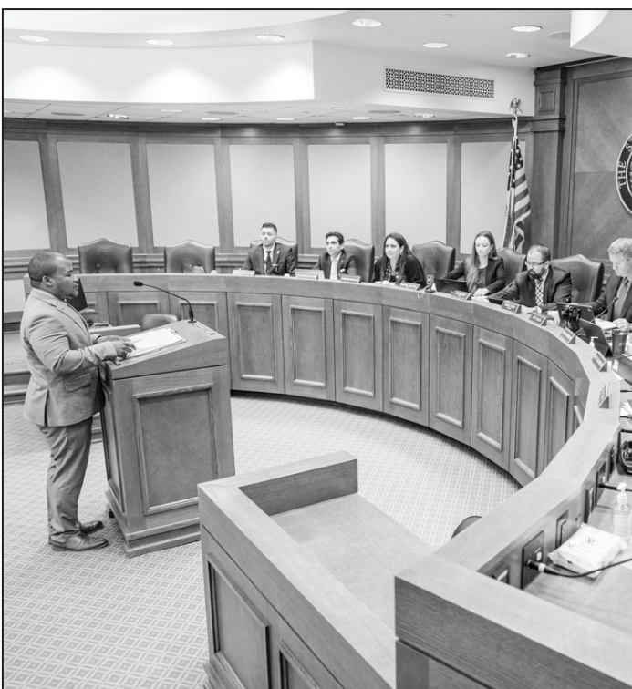
Representative Jones laying out House Bill 2055 before the House Committee on Criminal Jurisprudence.

Grants authorization to fire departments to remove property if it blocks roadways or endangers public safety.